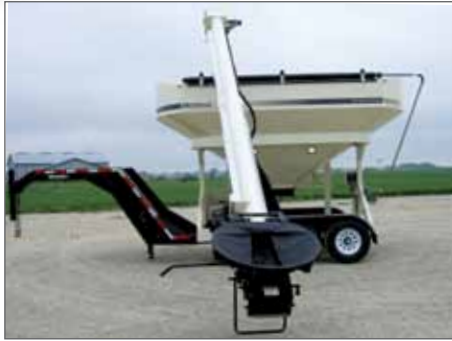
Self Fill Conveyor