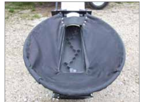
Meridian Cleaned Belt