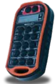
Variable Speed Remote Control with Display